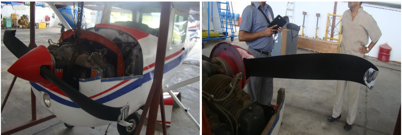
Picture taken from FWD LH