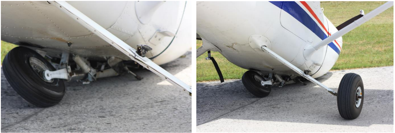
Picture taken from rear RH side