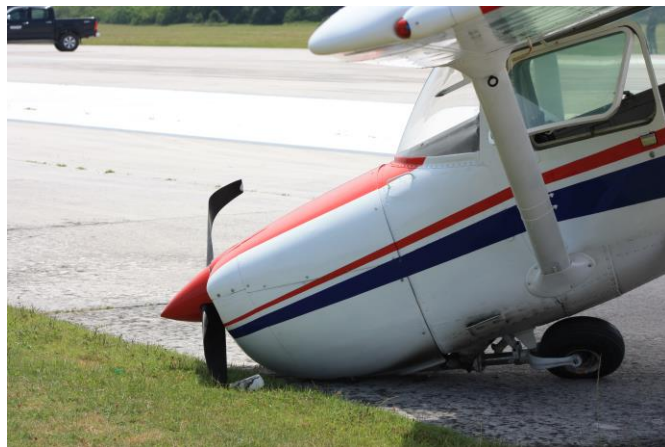
The nose landing gear collapsed on landing