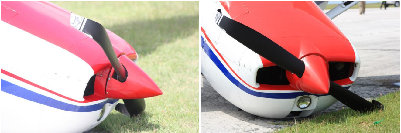
Picture taken from FWD RH side

Prop struck the ground when the landing gear collapsed