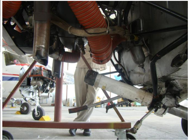
Picture taken from LH side